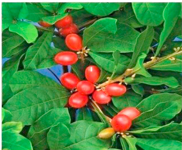
Figure 1. Miracle berry (Mangla and Kohli, 2018).

after the mouth has been exposed to the fruits. There has been a growing interest in the potential usage of the plant for centuries by local people of West Africa where the fruit has been used to sweeten sour foods and beverages such as Koko and Kenkey made from fermented maize and millet, and palm wine (Akinmoladun, 2016). Miraculin, a glycoprotein in the fruit has been credited with this property. Miraculin binds to the sweet receptor cells of the tongue and represses the feedback of a sour taste from the brain (Du et al., 2014). S. dulcificum has been considered as an impending food colorant because it produces orange-red color when added to carbonated water and sugar solution. It was categorized as an additive by the US Food and Drug Administration (Encyclopedia Britannica, 2019; Swamy et al., 2014).