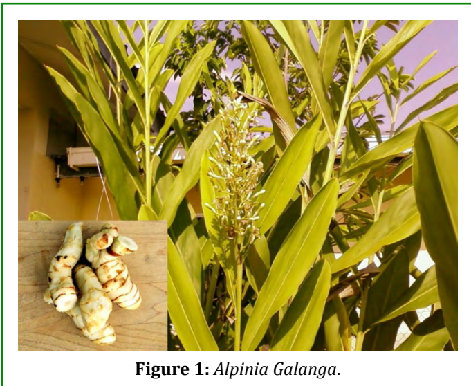
Figure 1: Alpinia Galanga .

Alpinia galanga is also known as Greater galanga in English and 'Kulanjan' in Hindi. Many parts of South India, where the doctors prefer the Ayurveda and Siddha mode of treatment by the help of Alpinia Galanga in treatment of different diseases including diabetes mellitus [8]. The harvest time period of Alpinia galanga is determined 3 month-intervals from 6 to 48 months after planting in Kerala, India. Harvesting for 42 months after plantation is the best way to get maximum output for realizing maximum rhizome (45.4 t/ha) and oil (127.4 liters/ha) yields, and for obtaining oil of good quality (27.1% cineole [eucalyptol]) [9]. A decent amount of oil (127.4 liters/ha) was acquired from the roots (19.5 t/ha) after 39 months of plantation. The shoot yield (40.5 t/ha) and shoot oil yield (70.61 h/a) were maximum at 18 months after plantation [10]. A. galanga reached a maximum height of 129.4 cm with more than 48 tillers per clump and 13 leaves per tiller in the experimental location [11].